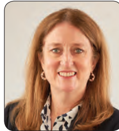
Rt Hon Jacqui Smith Chair

Welcome to University Hospitals Birmingham NHS Foundation Trust (UHB). This is an enlarged, combined organisation: the result of the merger by acquisition of Heart of England NHS Foundation Trust by UHB, to deliver more equitable patient access to better quality and integrated healthcare across Birmingham, Solihull and South Staffordshire.