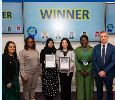
Cellular Pathology, Queen Elizabeth Hospital and Heartlands Hospital