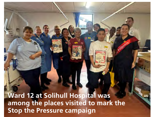
Ward 12 at Solihull Hospital was among the places visited to mark the Stop the Pressure campaign

There was also a focus on inclusivity, skin tones and end-of-life care.