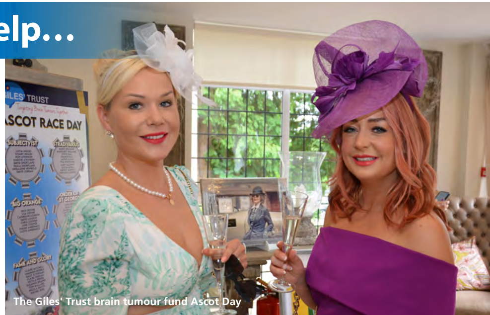
The Giles' Trust brain tumour fund Ascot Day

We have something for everyone, from mountain treks to marathons, pub quizzes to glamorous balls. If you fancy taking on a challenge this year, join us on our once-in-a-lifetime trek to China, where you will get to walk a remote section of the Great Wall of China, from Gubeikou to Jinshanling and Simatai. You could also think up your own challenge or fundraising event to support the charity, from a sponsored walk to a bake sale. Just drop us an email on: charities@uhb.nhs.uk and we'll support you all the way.