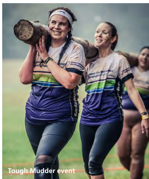
Tough Mudder event

We are continuing to support our young patients across our hospitals from the moment