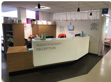
Radiotherapy waiting area