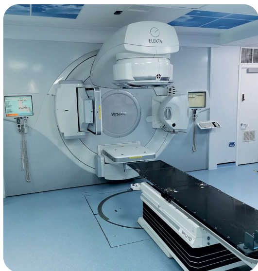
Linear Accelerator treatment room