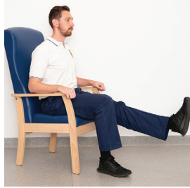
Straight leg raises