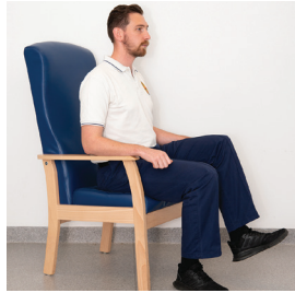
Knee to chest