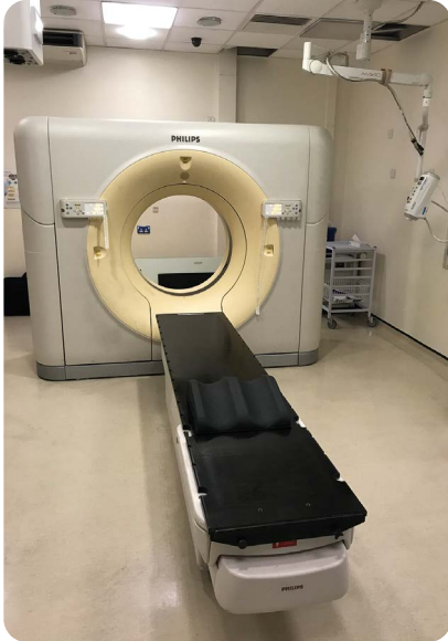
CT Planning Scanner

Everybody's radiotherapy treatment is tailored to them individually and so the process of planning can take a number of weeks.