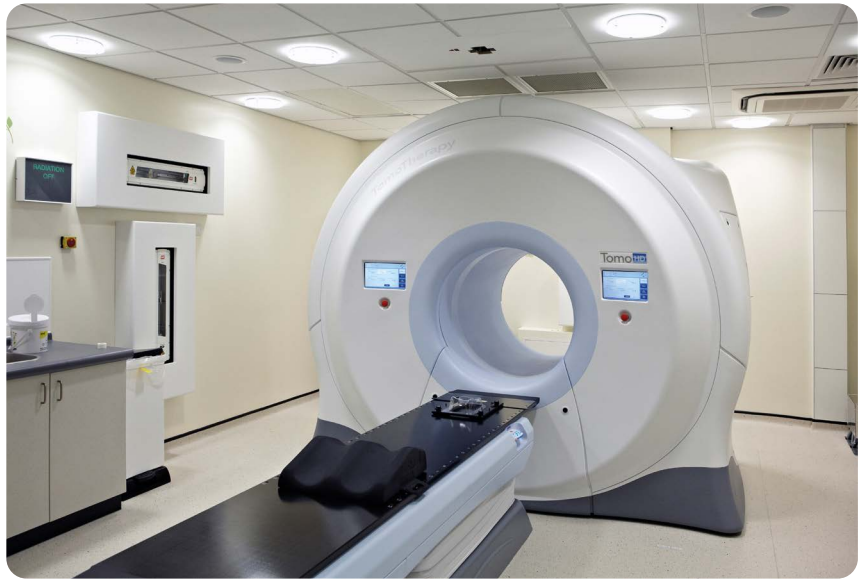
TomoTherapy treatment room

Once treatment is finished for the day then you are all free to go home. The doctor will normally review your child once a week at the Queen Elizabeth Hospital whilst they are having treatment.