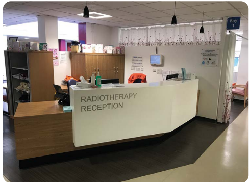
Radiotherapy waiting area