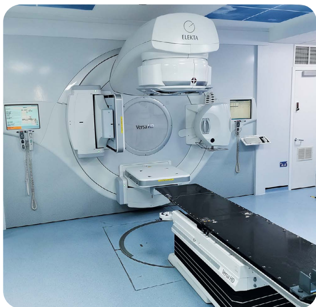
Linear Accelerator treatment room