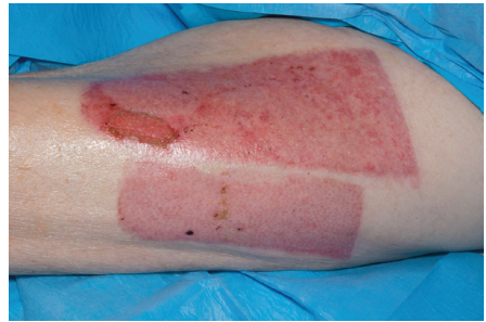
Donor site of Split Skin Graft