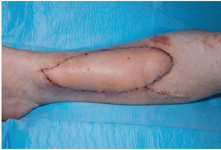
ALT free flap