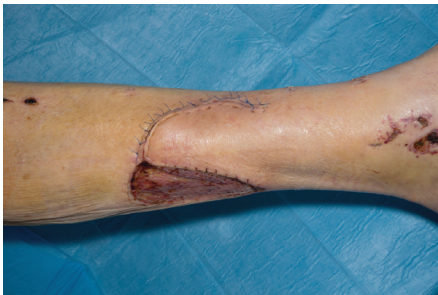
Pedicled flap and Split Skin Graft

A pedicled flap is when the tissue is left partly attached to the donor site (pedicle) and then moved to the new location, thereby keeping the tissue with a blood supply.